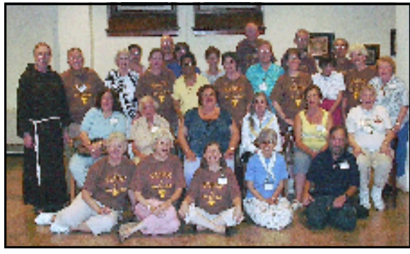
Your Basic FLICers!