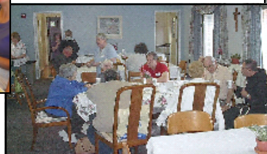
Day of Recollection at Tabor House