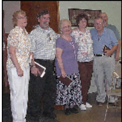
Election: The new Cure Council