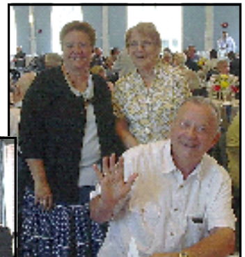
The Brothers give a party