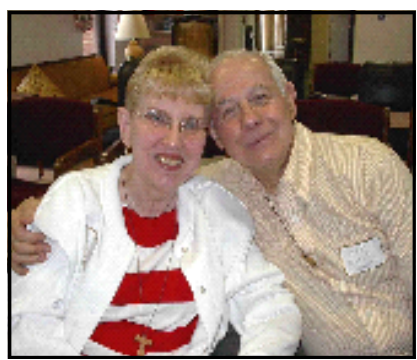
The last picture...The Consortes