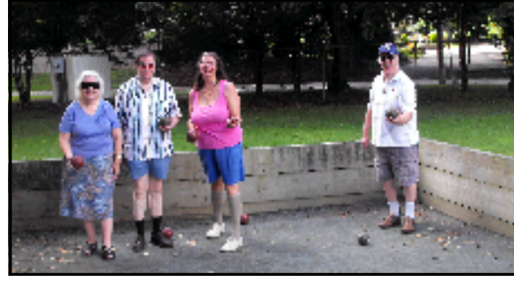
Picnic: Don't accept the ball...He's a Ringer!