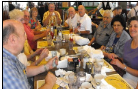
Tuesday SFO "Philosophy" Club Lunch, anyone?