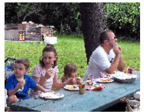
The Children "Harni!"