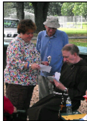
Any for me?