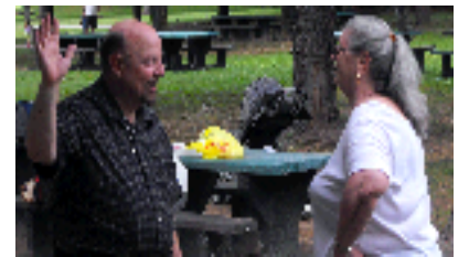
The "HarnOS," himself !