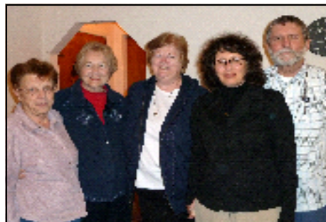
Elections at Ave Maria Fraternity Nov.15 at St. Peter's, Islip Terrace