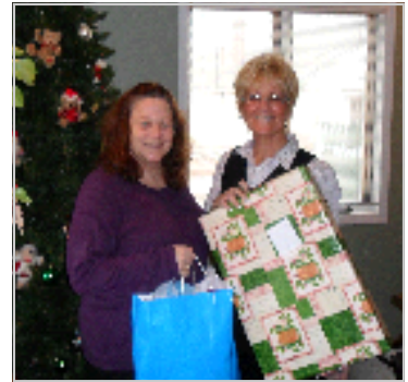
Christmas Gifts for Mercy Center St. Lawrence of Brindisi Fraternity