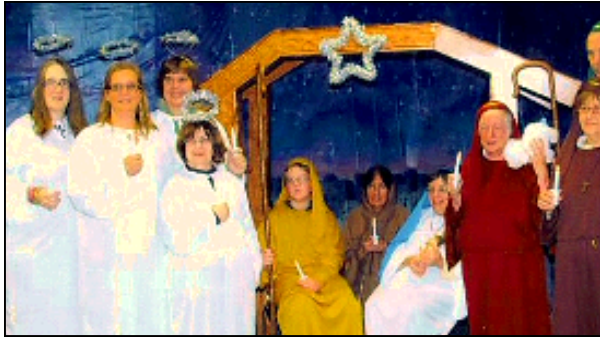
Greccio Service at St. Adalbert December 18