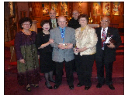
Profession at New Pentecost Frat. St. Matthew Church, October 10