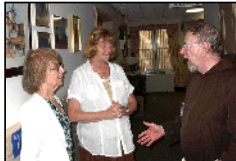
Familiar faces at FLIC in August