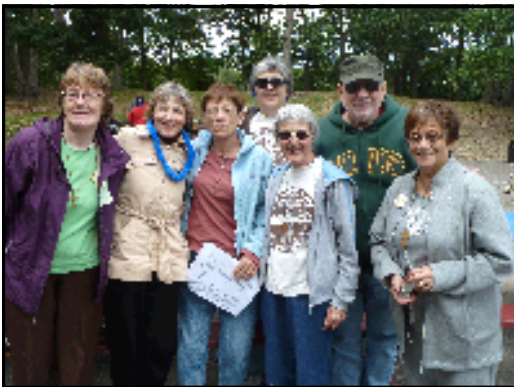
Group at the "Getting to Know You Picnic"