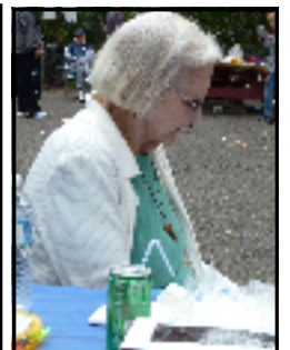
Studying the music