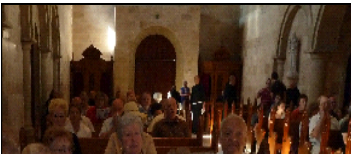
At St. Anthony's Chapel before Portiuncula celebration 7/31