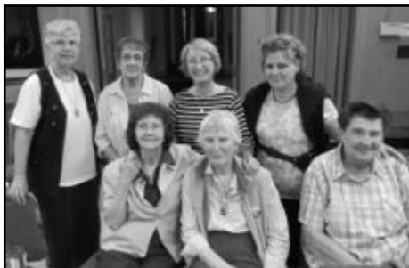
St. Thomas More Fraternity