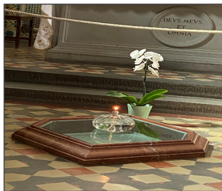
Site of Francis' stigmatization on Alverna