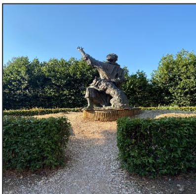
Francis and the Wolf of Gubbio