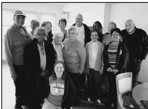
Bl. Raymond Lull Fraternity